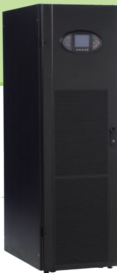
Liebert NX 40, 60, 80, 100 & 120 kVA