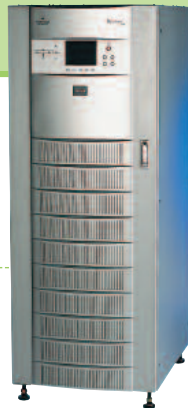
Liebert NX 10, 15, 20 & 30 kVA

There is a Liebert NX UPS system that is ideally suited to power electronic equipment in your small to medium business: